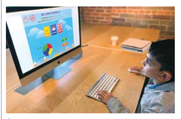
MoneyPrep uses online games to help kids learn financial literacy skills.